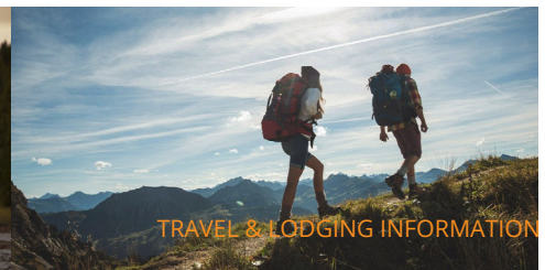
TRAVEL & LODGING INFORMATION