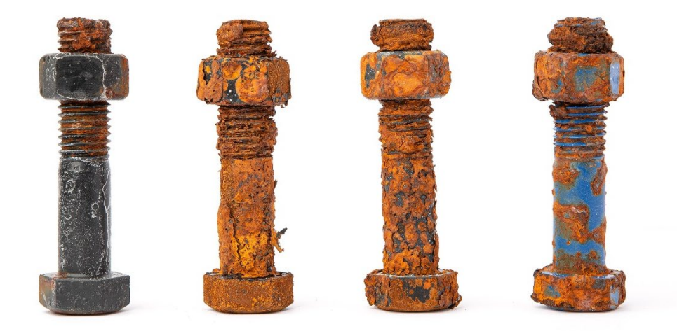
Photo 12. Corrosion levels of Cerakote Blackout after 4,000 hours, Teflon Black and Teflon Metallic Black after 640 hours, and Xylan after 1871 hours.